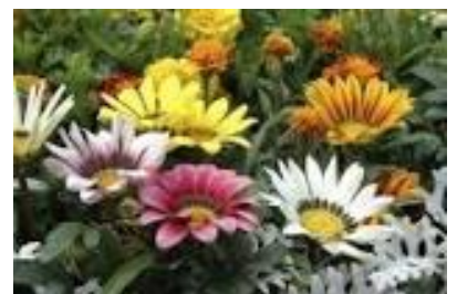
Erigeron (top) Gazanias (below)