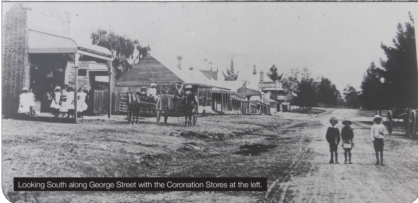
Looking South along George Street with the Coronation Stores at the left.