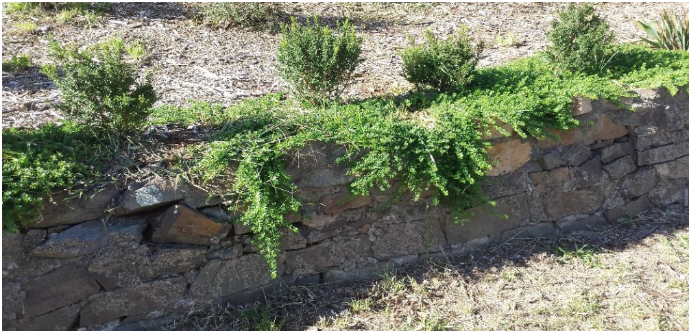
The ground covers on the wall of the station garden, which have grown very well since September

Despite the bouts of torrid heat wave weather that we’ve had, the station garden is looking great. The eucalypts in the roundabout outside the station have been very scorched although they have green shoots on them, so fingers crossed. The banksias are doing marvellously well.