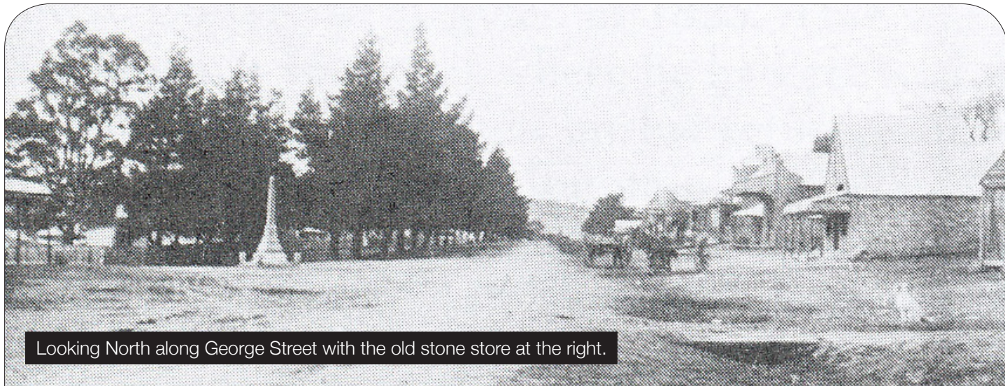
Looking North along George Street with the old stone store at the right.